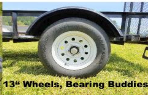
13" Wheels, Bearing Buddies