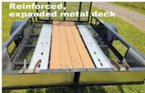
Reinforced, expanded metal deck

Tickets available Friday and Saturday at the Hodaka Club registration desk or Saturday night at the awards banquet. Drawing is Saturday 6/24. You do not need to be present to win. Tickets $5.00